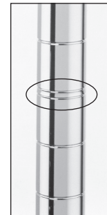
SiteSelect Posts feature double grooves every 8" (203mm) to aid assembly.