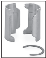
Aluminum Split Sleeve