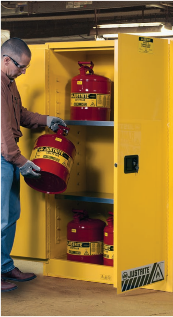
Complies with OSHA and provides 10 minutes of evacuation time.