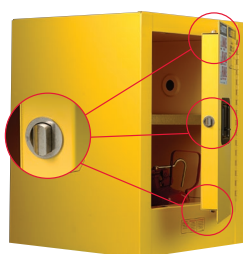
45-gal (170-L) self-close door style

Stainless steel, 3-point bullet self-latching system provides fail-safe, positive door closure with increased heat resistance.